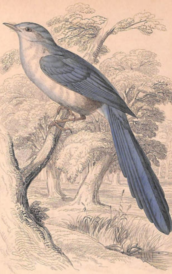
CERULEAN OR LONG-TAILED FLYCATCHER