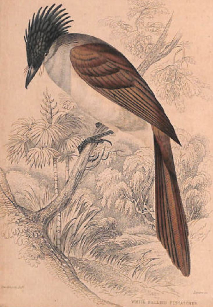
WHITE BELLYED FLYCATCHER