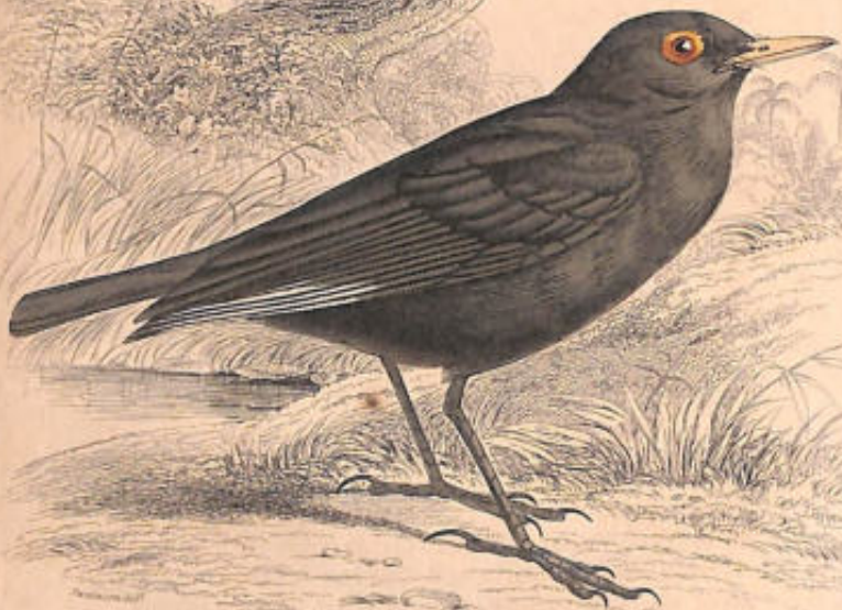
SPECTACLE OR WHITE-WINGED WATER-THRUSH