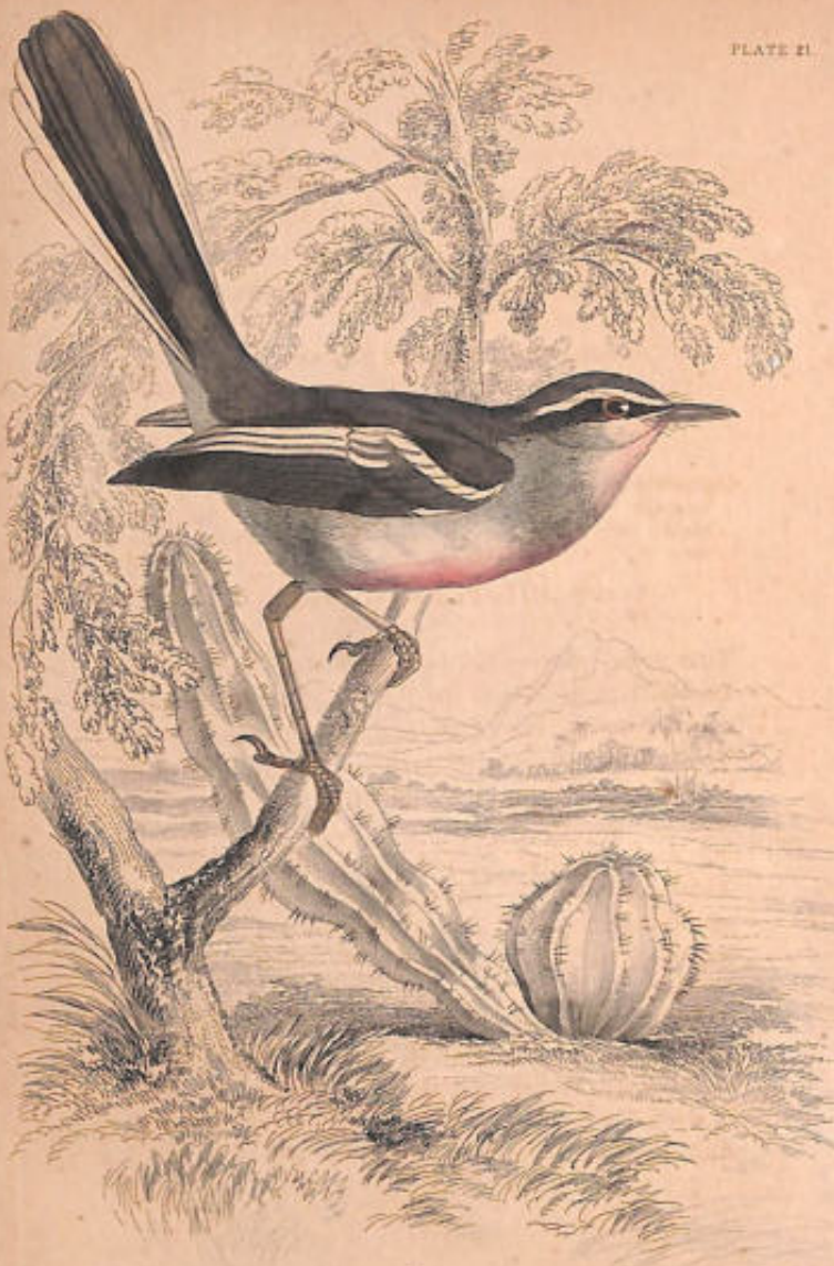
LONG-TAILED AFRICAN TODY