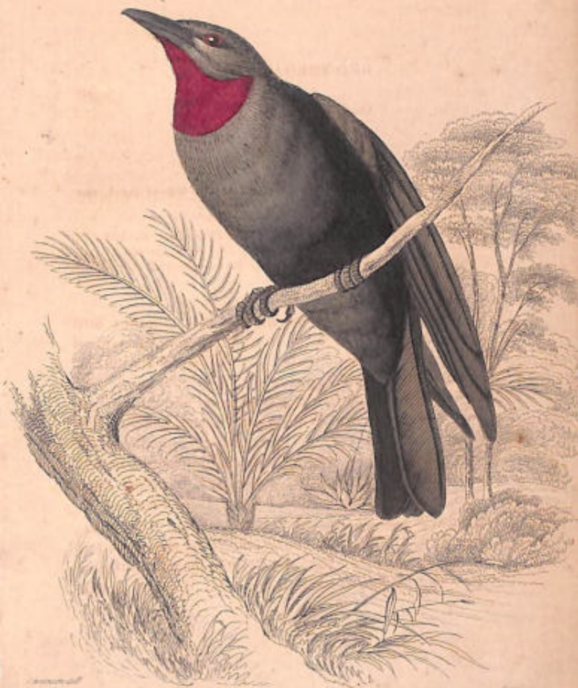
RED THROATED PUA