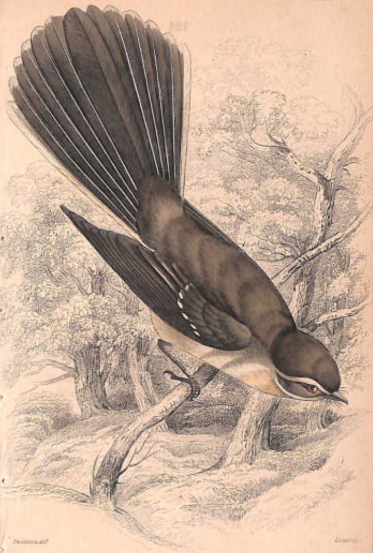
WHITE SHAFTED YAN TAIL.