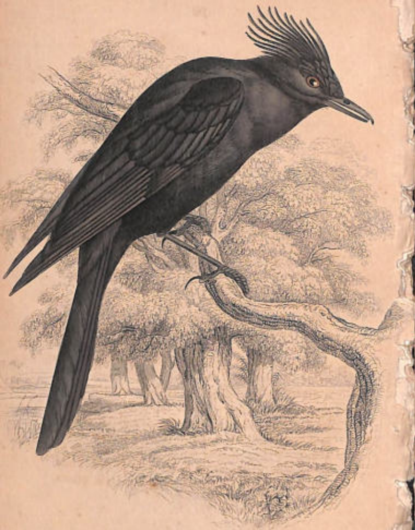
CRESTED BLACK WATER CHAT