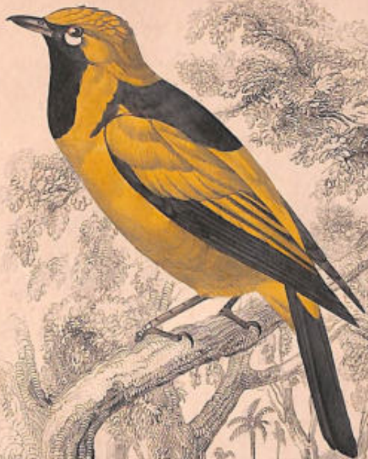
GOLDEN HOODED FLYCATCHER