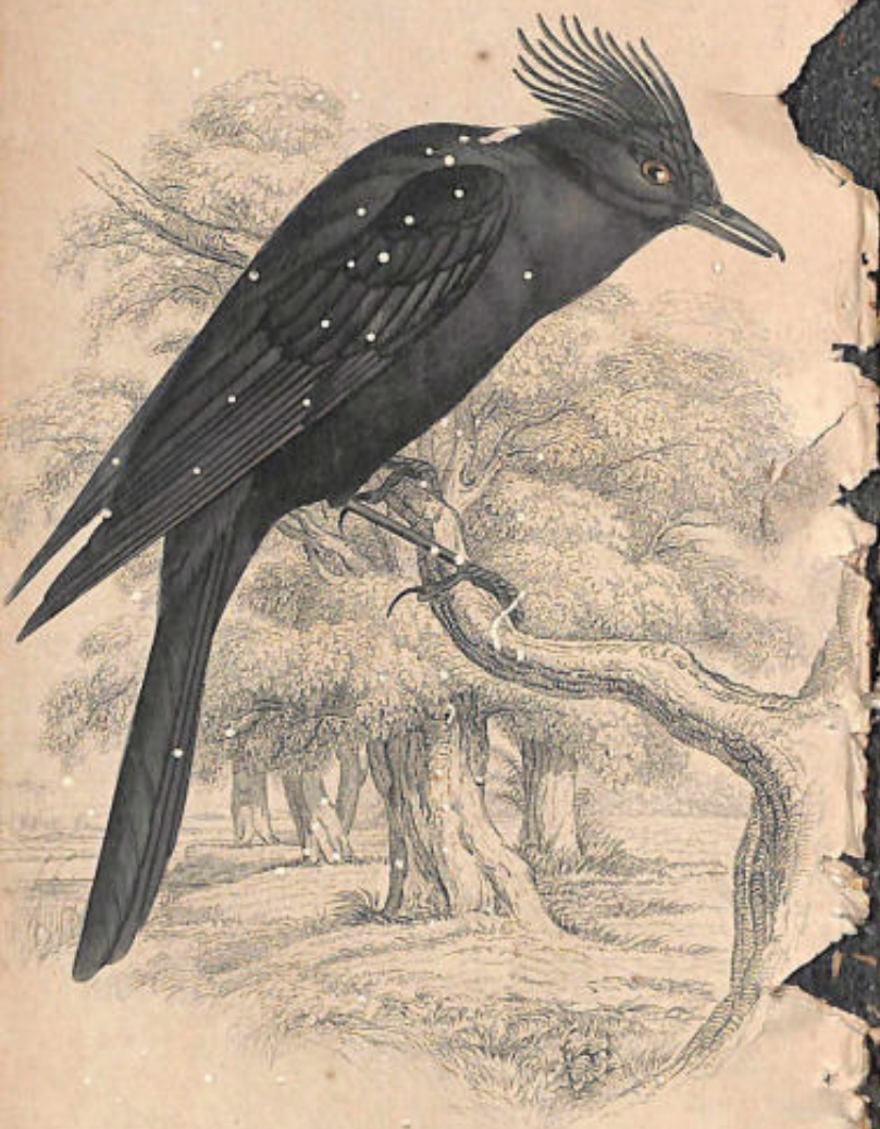
CROWNED BLACK WATER-CAT