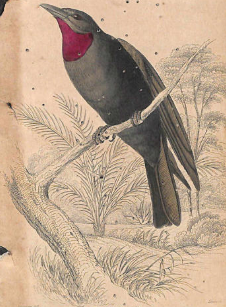
RED THROATED TIBA