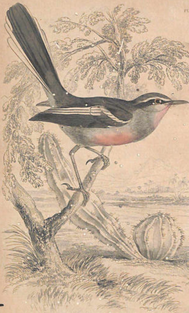
LONG-TAILED AFRICAN TODY