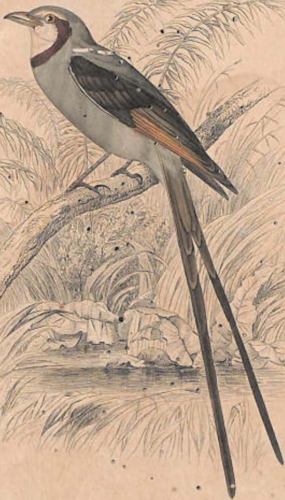
SCISSOR-TAIL SWALLOW BLACKCAP.