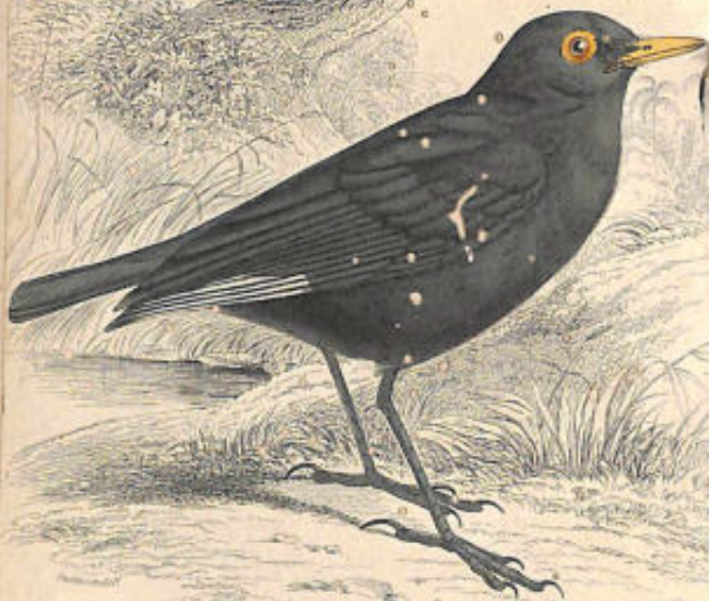
SPECTACLED OR WHITE-WINGED WATER-CAT