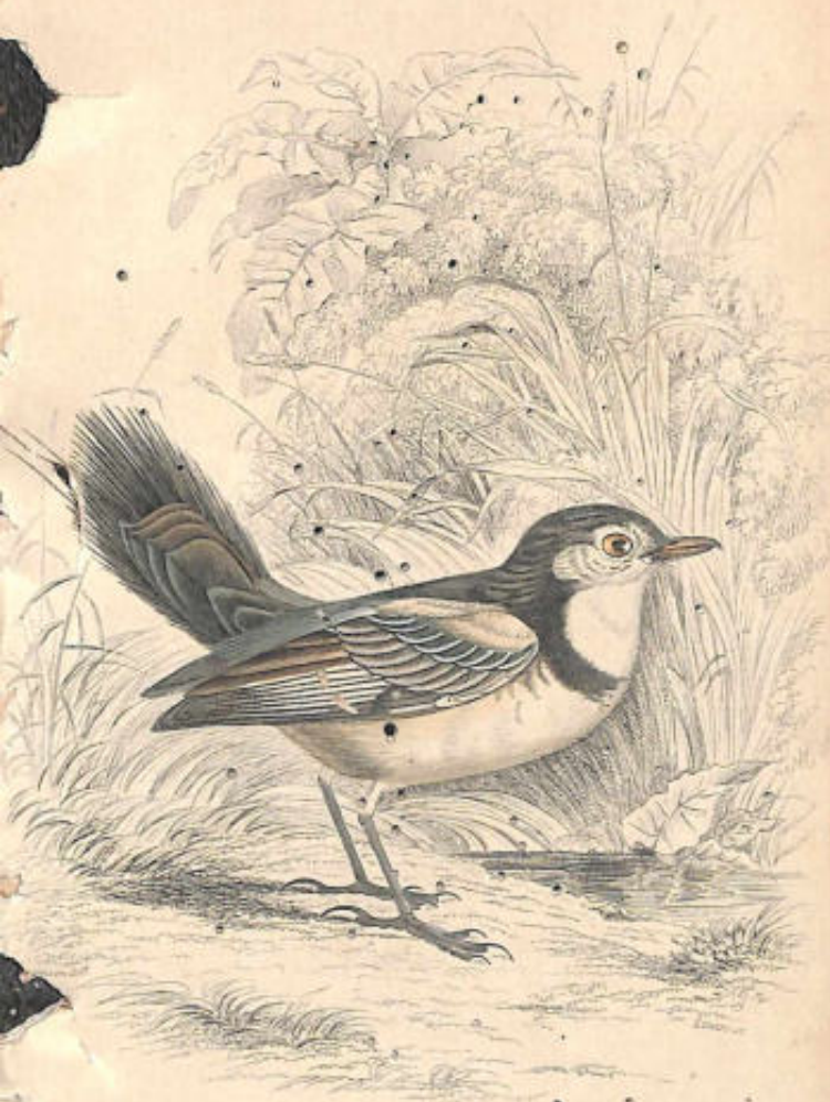
LONG-TAILED WATER THRUSH