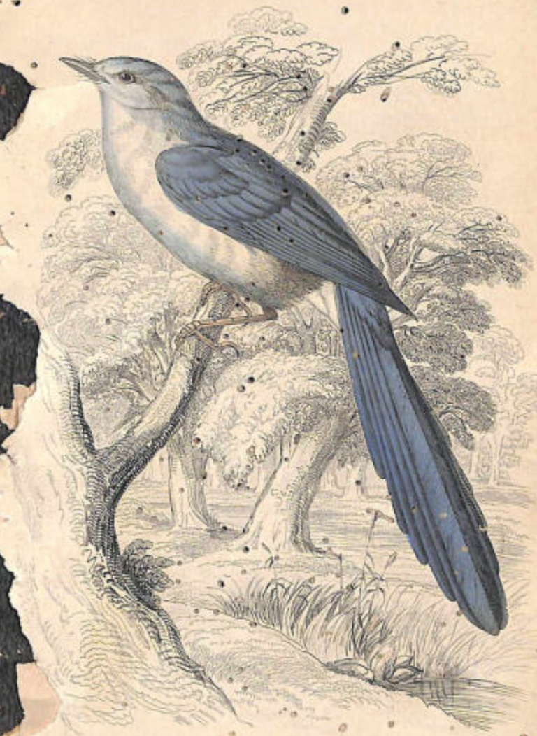
CERULEAN OR LONG-TAILED FLYCATCHER