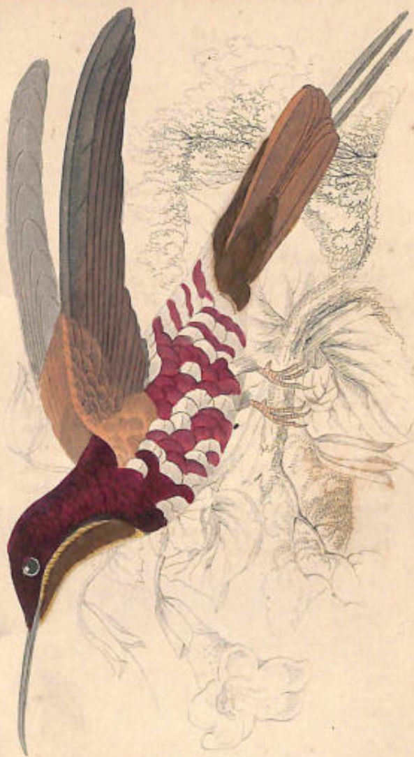
TROCHILUS FELLA variegata with White