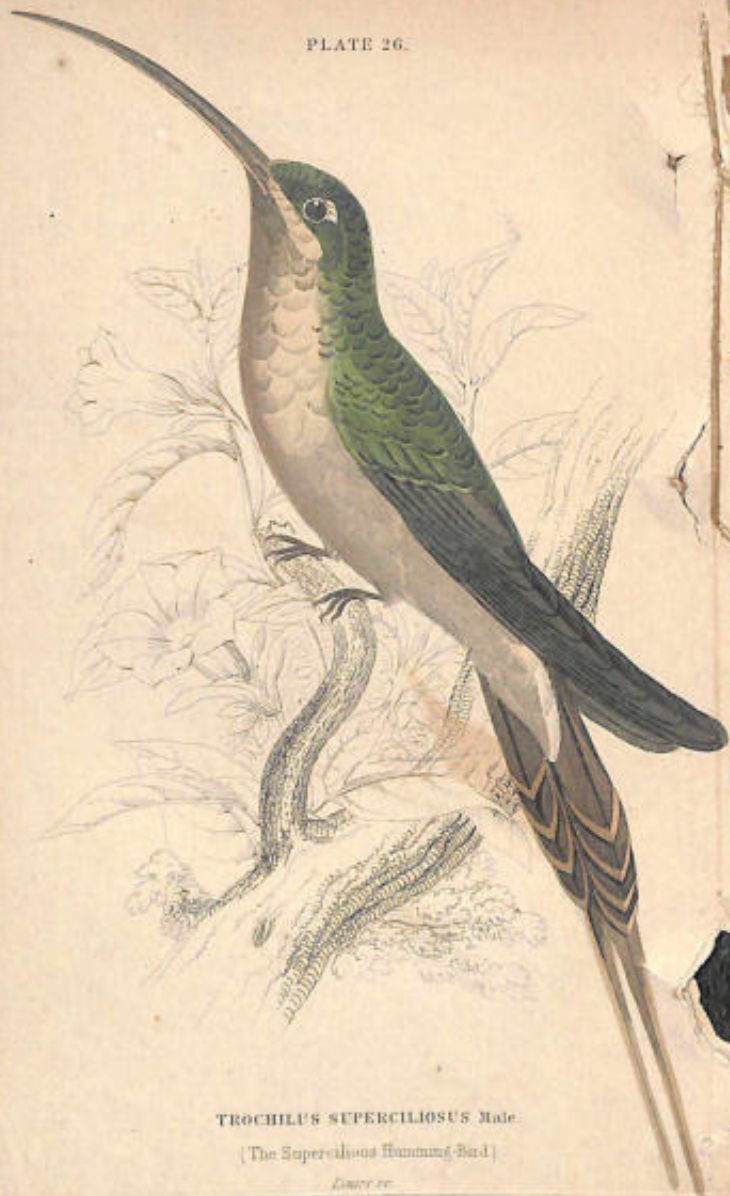
TROCHILUS SUPERCILIOSUS Male.