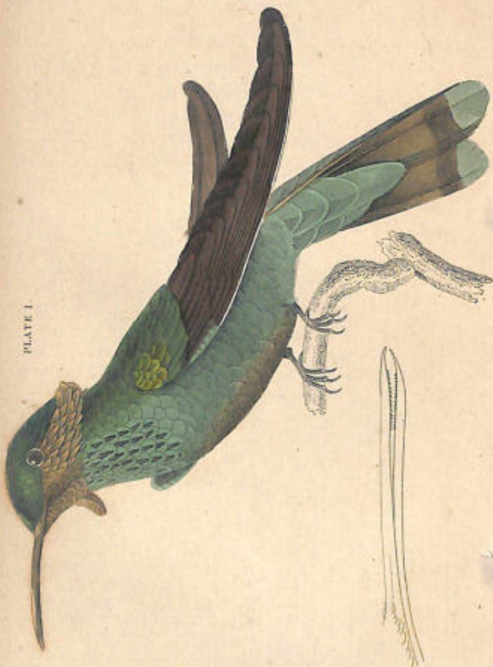
TROCHILUS AXAIS. (Blue-bellied Saw-billed Hummingbird.) Lesson sc.