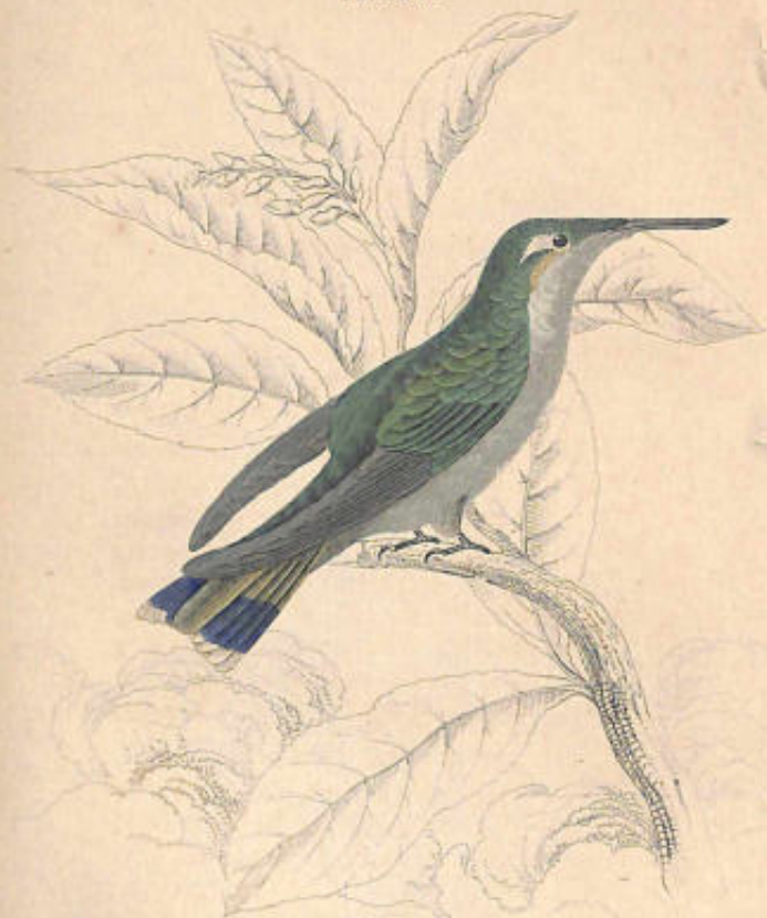
TROCHILUS DELALANDII female