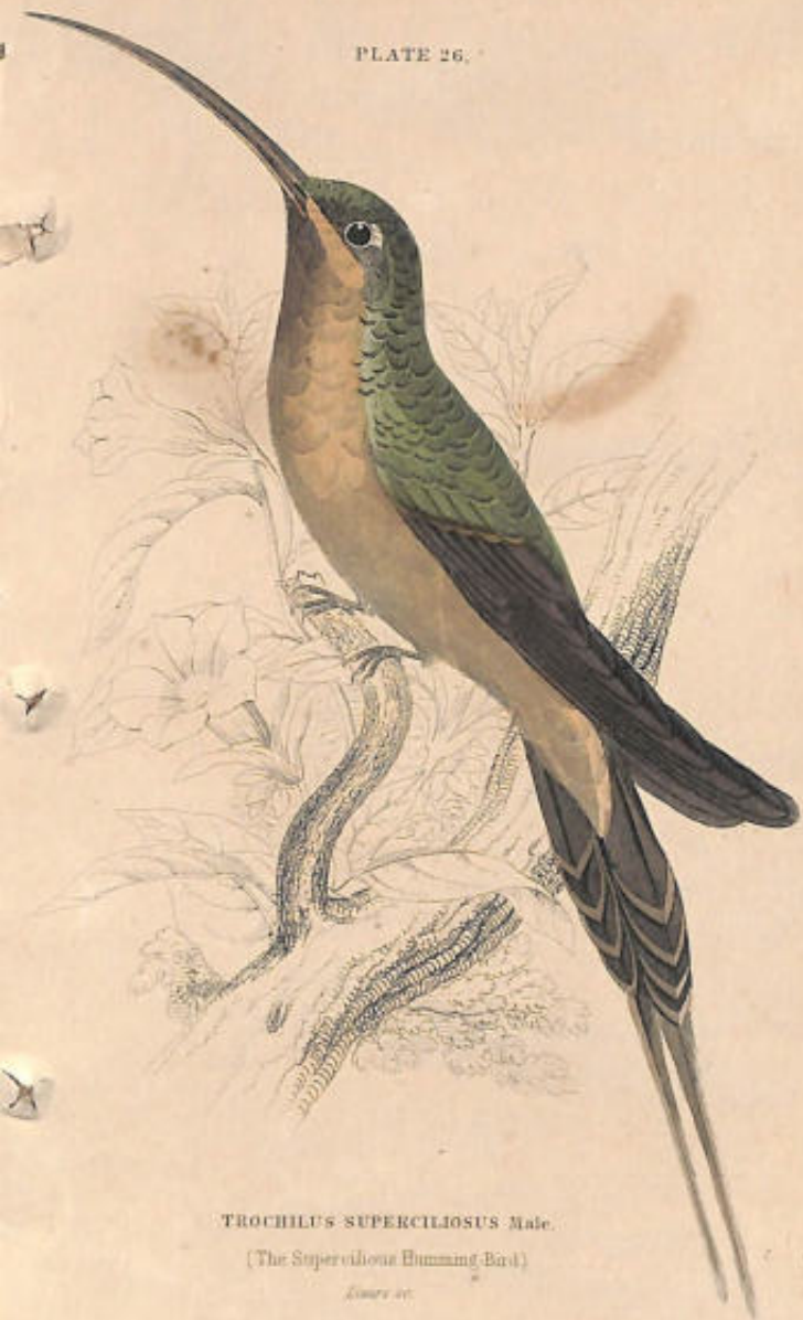
TROCHILUS SUPERCILIOSUS Male.