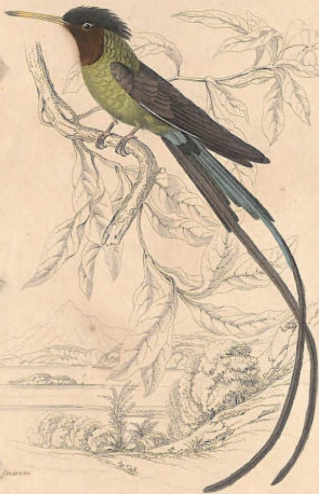
TROCHILUS POLYTMUS. (Black-capped Humming-Bird.)