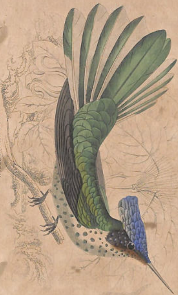
TROCHILUS ST. ONESI (St. Onésimo, Brazil)