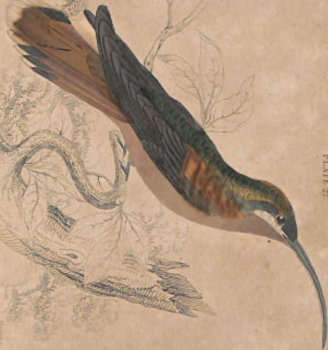
TROCHILUS STEEP-BILLED HUMMINGBIRD