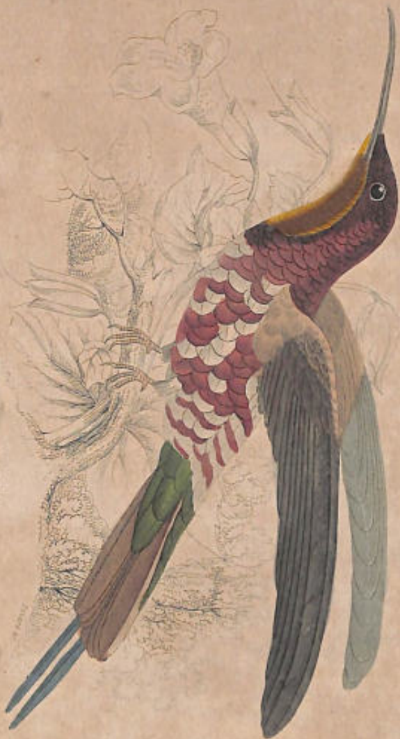
TROCHILUS VELLERII var. with white