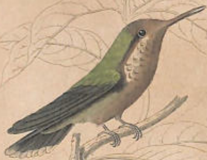
TROCHILUS MAGNIFICUS. Young Male.