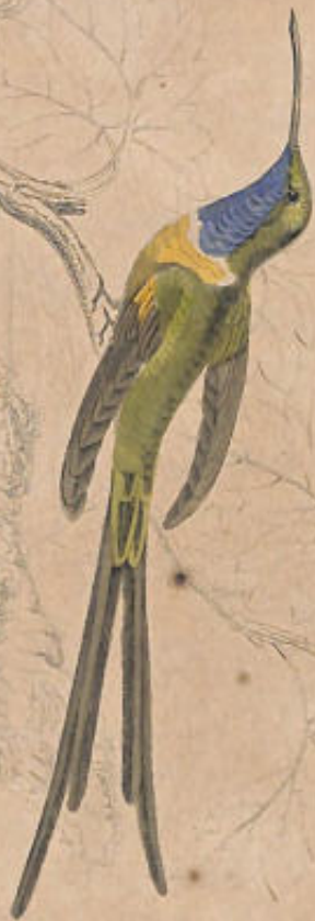
TROCHILUS ENLAPTES (Baird's Forked Hummingbird, Baird.)