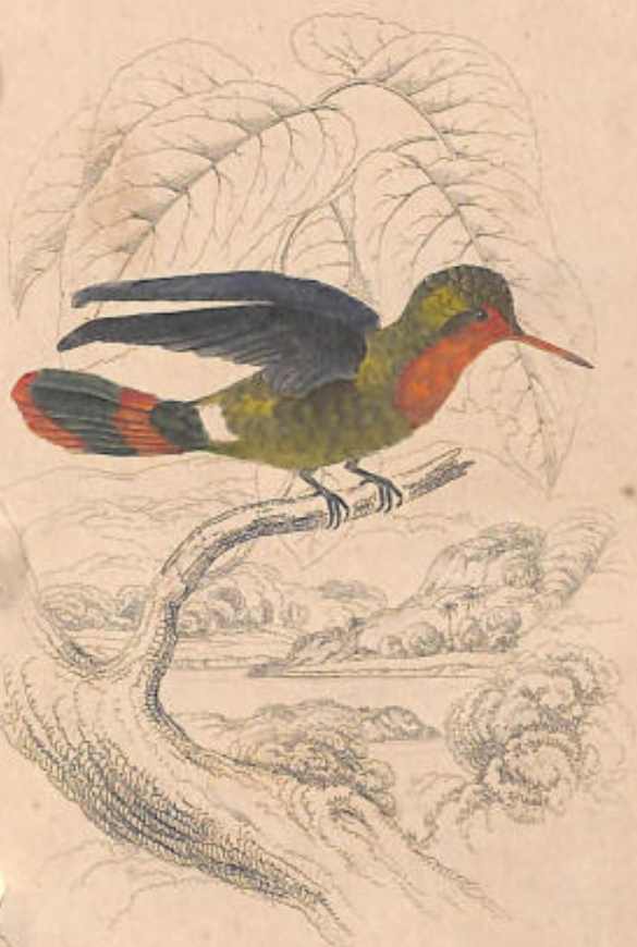
TROCHILUS ORNATUS, Female. (The Tufted-necked Humming Bird.)