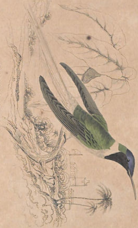
TROCILITES CORNUTUS, Female.