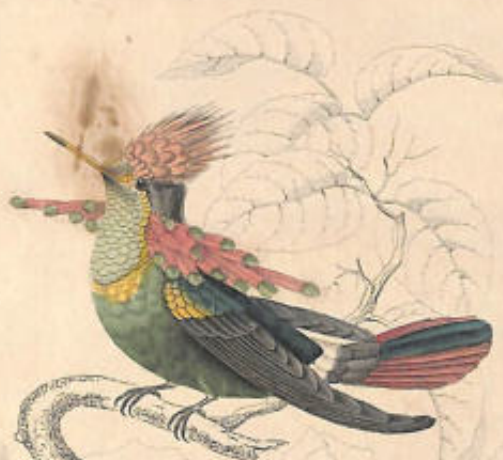
TROCHILUS ORNATUS, Male. (The Tufted-necked Humming Bird.)