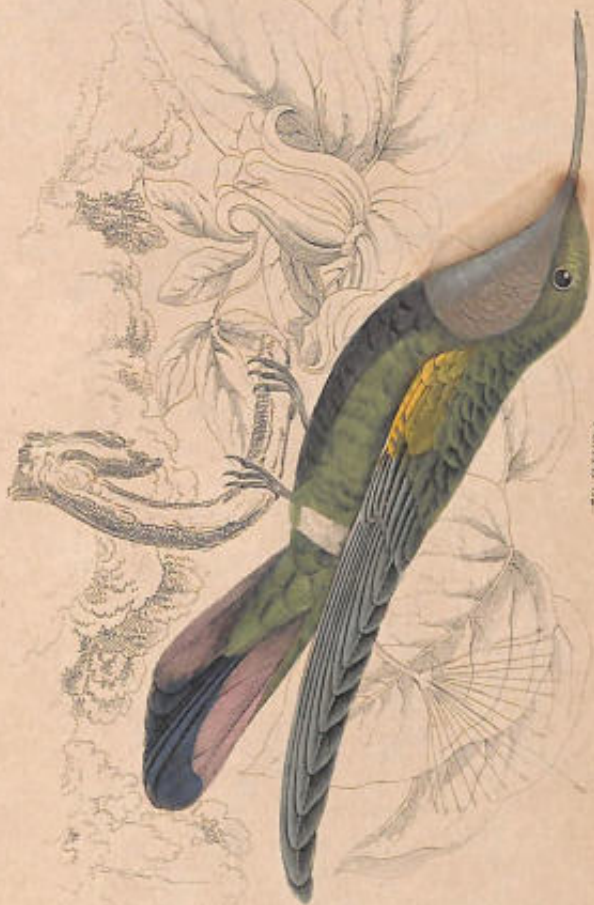
TROPICHTHYX GRAMMURUS. Adult Male.