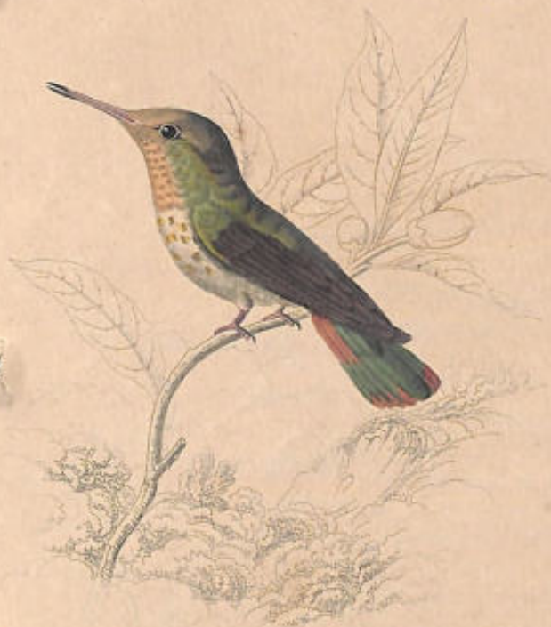
TROCHILUS MAGNIFICUS, Female.