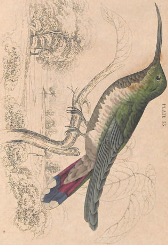
TROCHILUS GRAMINEUS, Young.