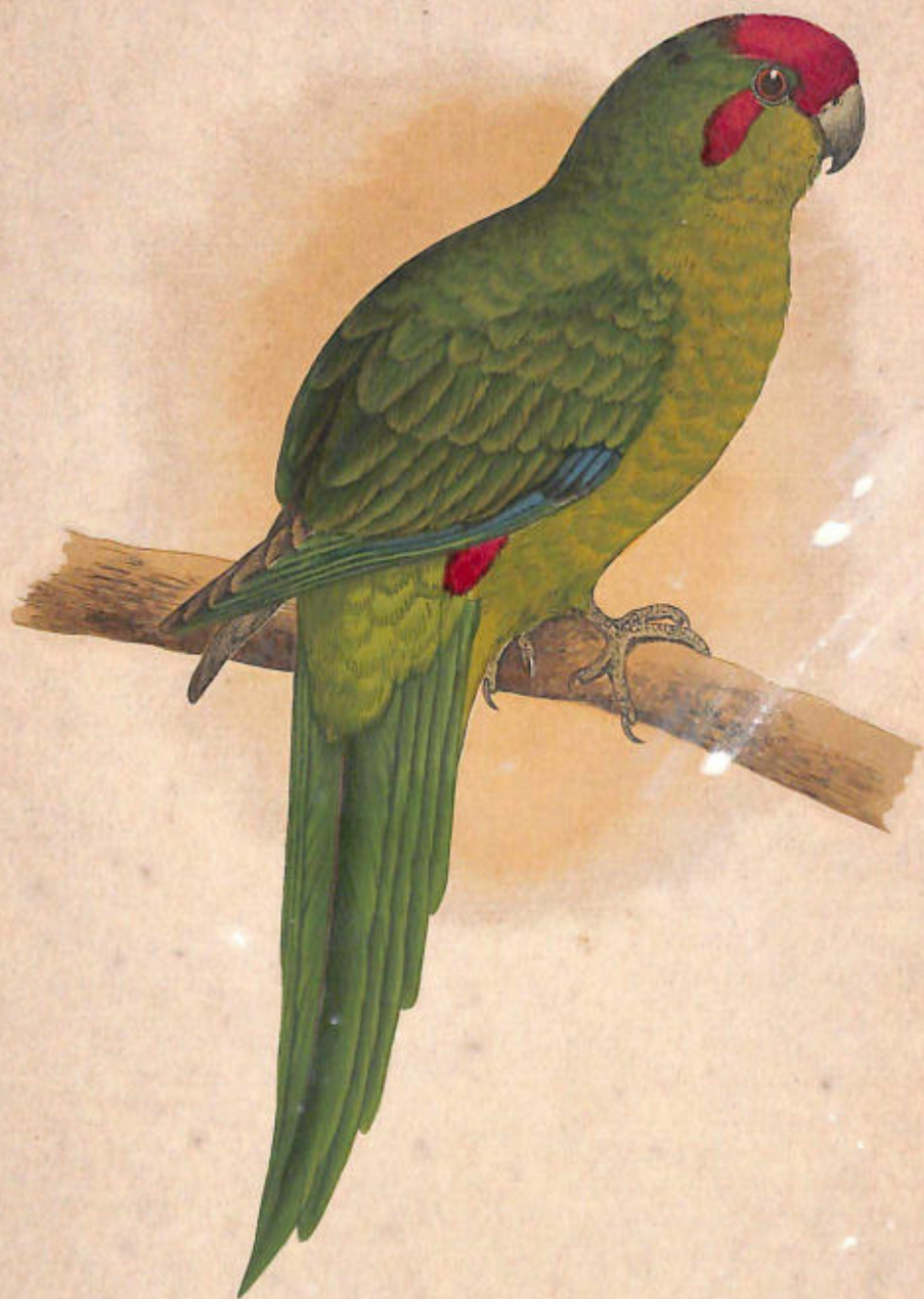
NEW ZEALAND PARRAKEET.