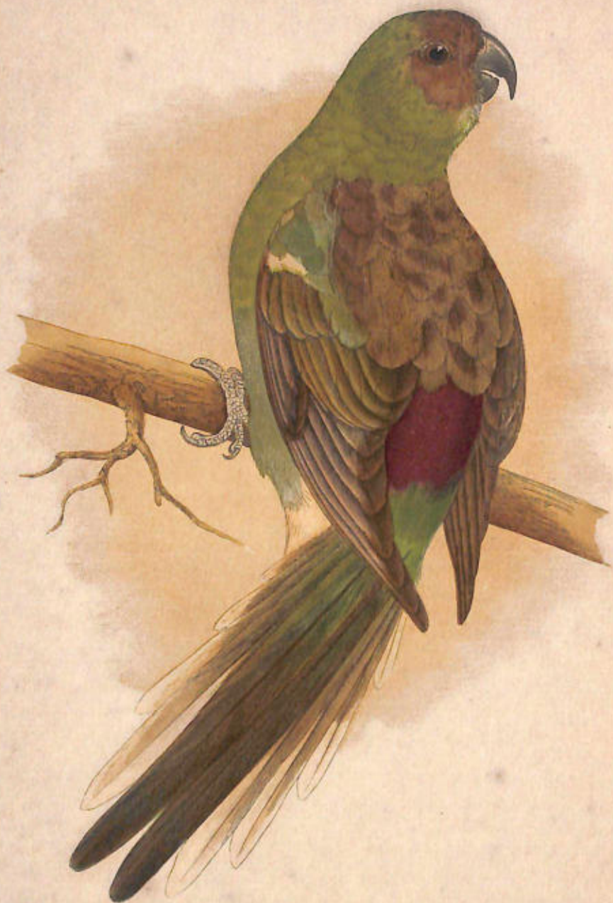
BLOOD- OR RED-RUMPED PARRAKEET.