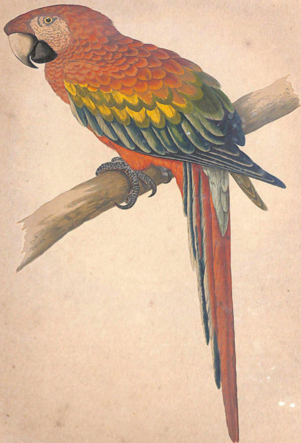
RED AND BLUE MACAW.