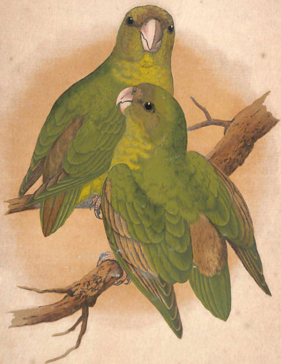
PASSERINE OR BLUE-WINGED PARRAKEET.