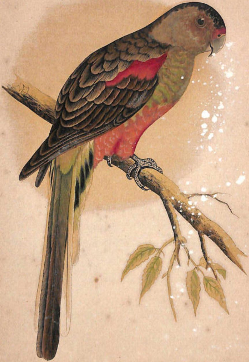
BEAUTIFUL OR PARADISE PARRAKEET.