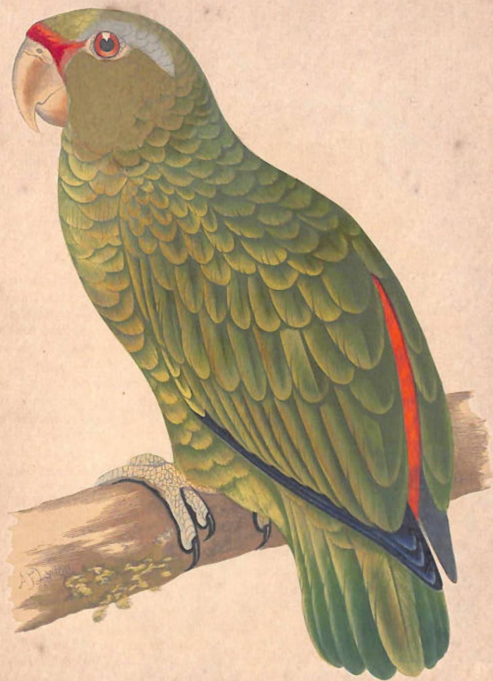
FESTIVE AMAZON PARROT.