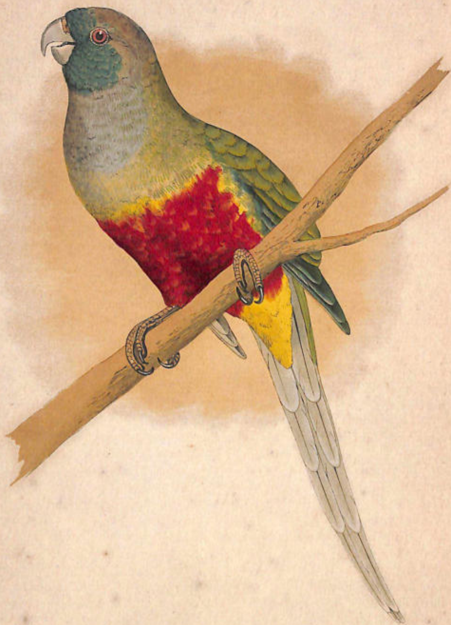
BLUE BONNET PARRAKEET.