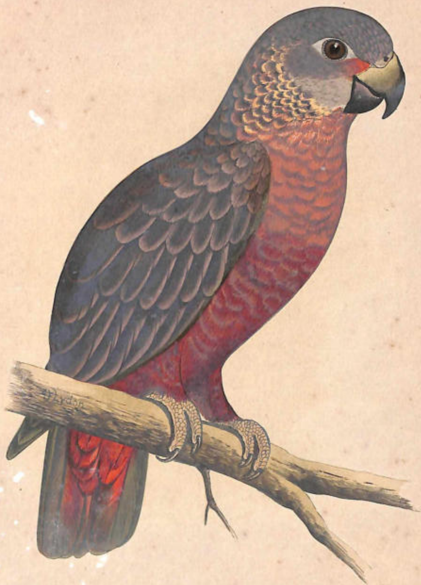
DUSKY OR VIOLET PARROT.