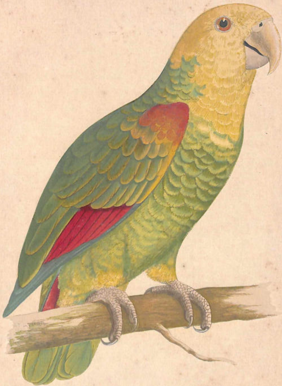
DOUBLE-FRONTED OR LE VAILLANT'S AMAZON.