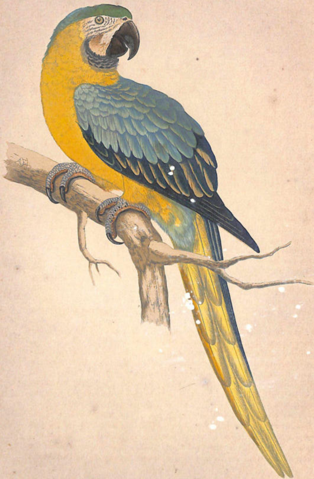
BLUE AND YELLOW MACAW.