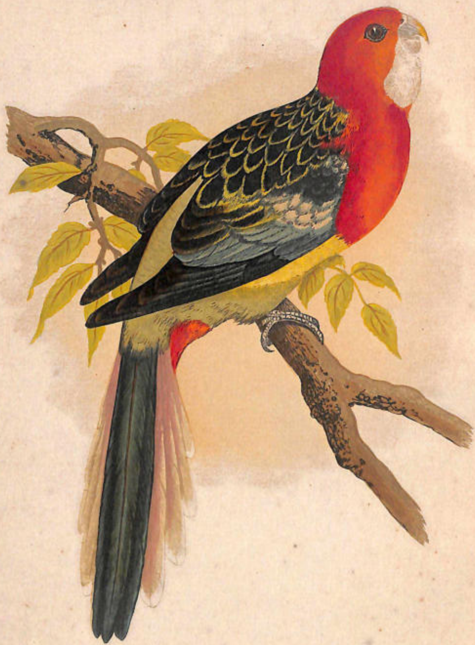
ROSE-HILL OR ROSELLA PARRAKEET.