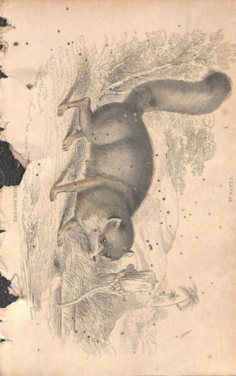
FISH DOG FOX