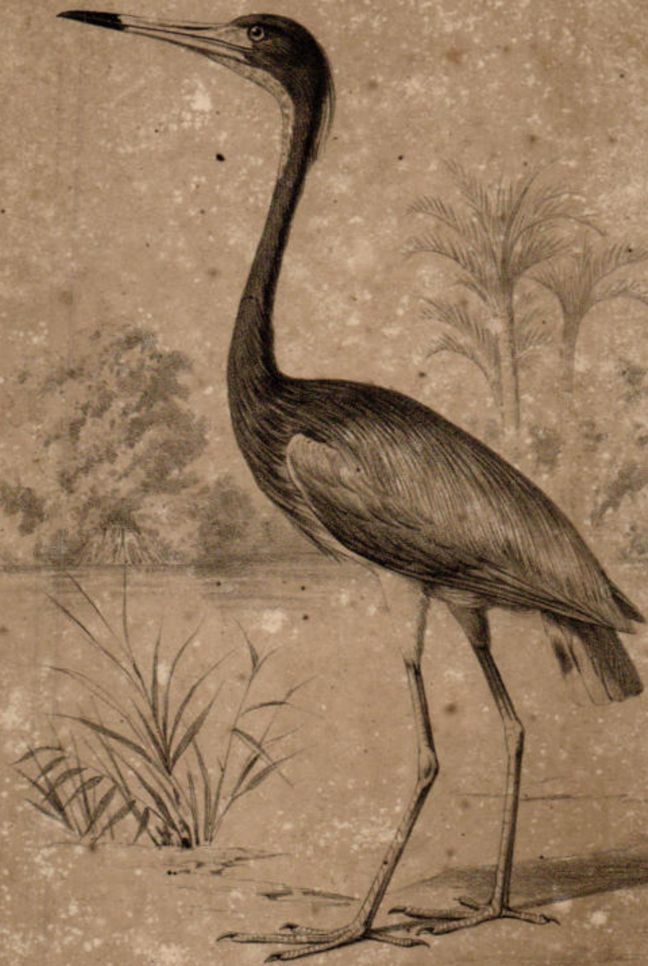
ARDEA CYANIROSTRIS Inagua Heron