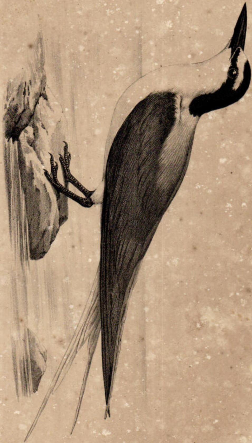
STERNA ANOSTHAETA Buller Tern