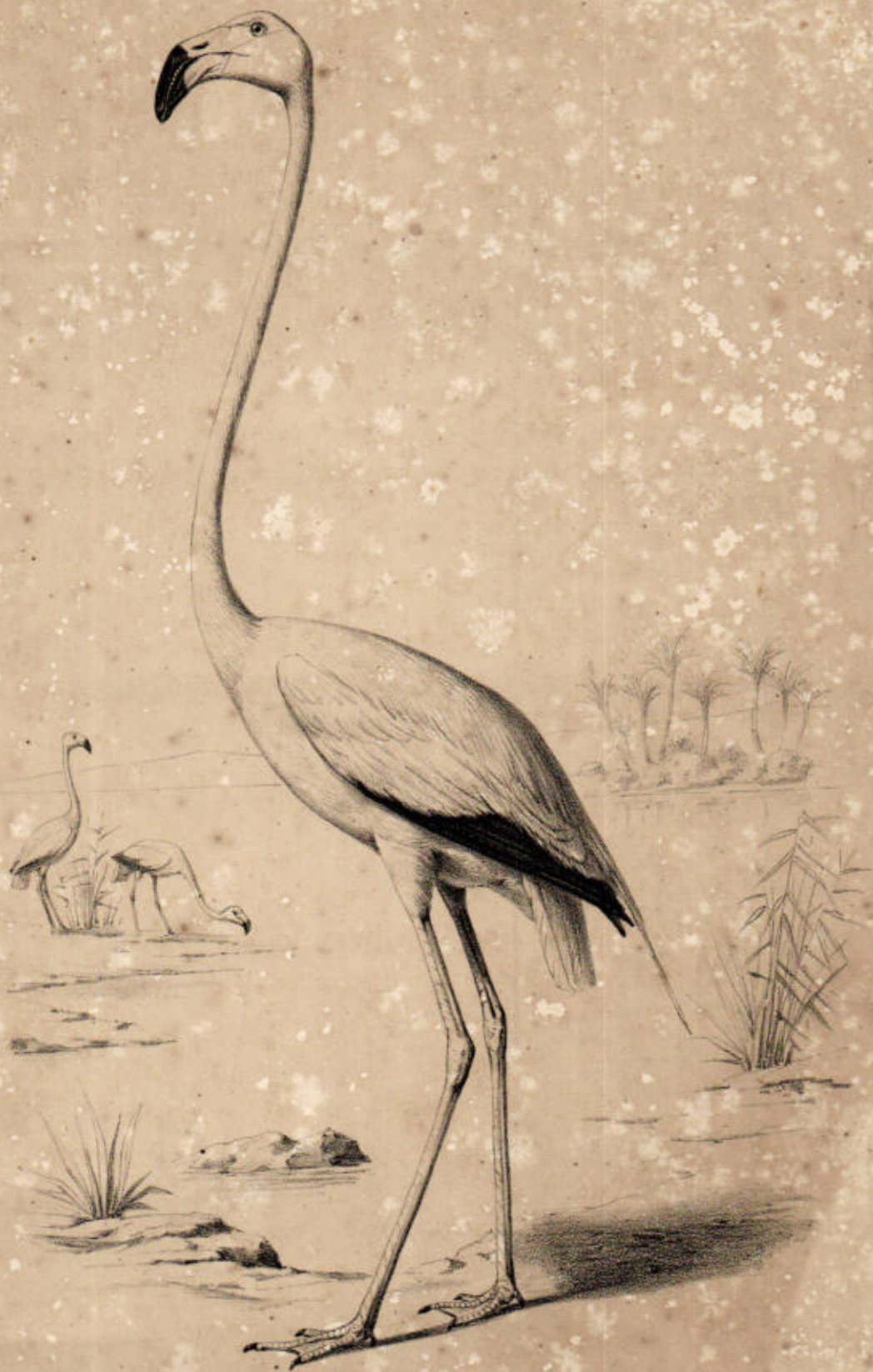
PHOENICOPTERUS RUBER Flamingo