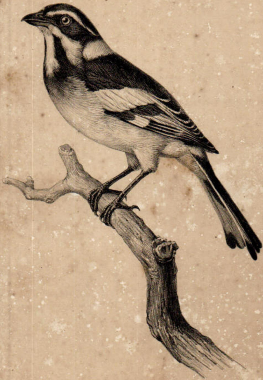
SPINDALIS ZENA. Bahama Finch.