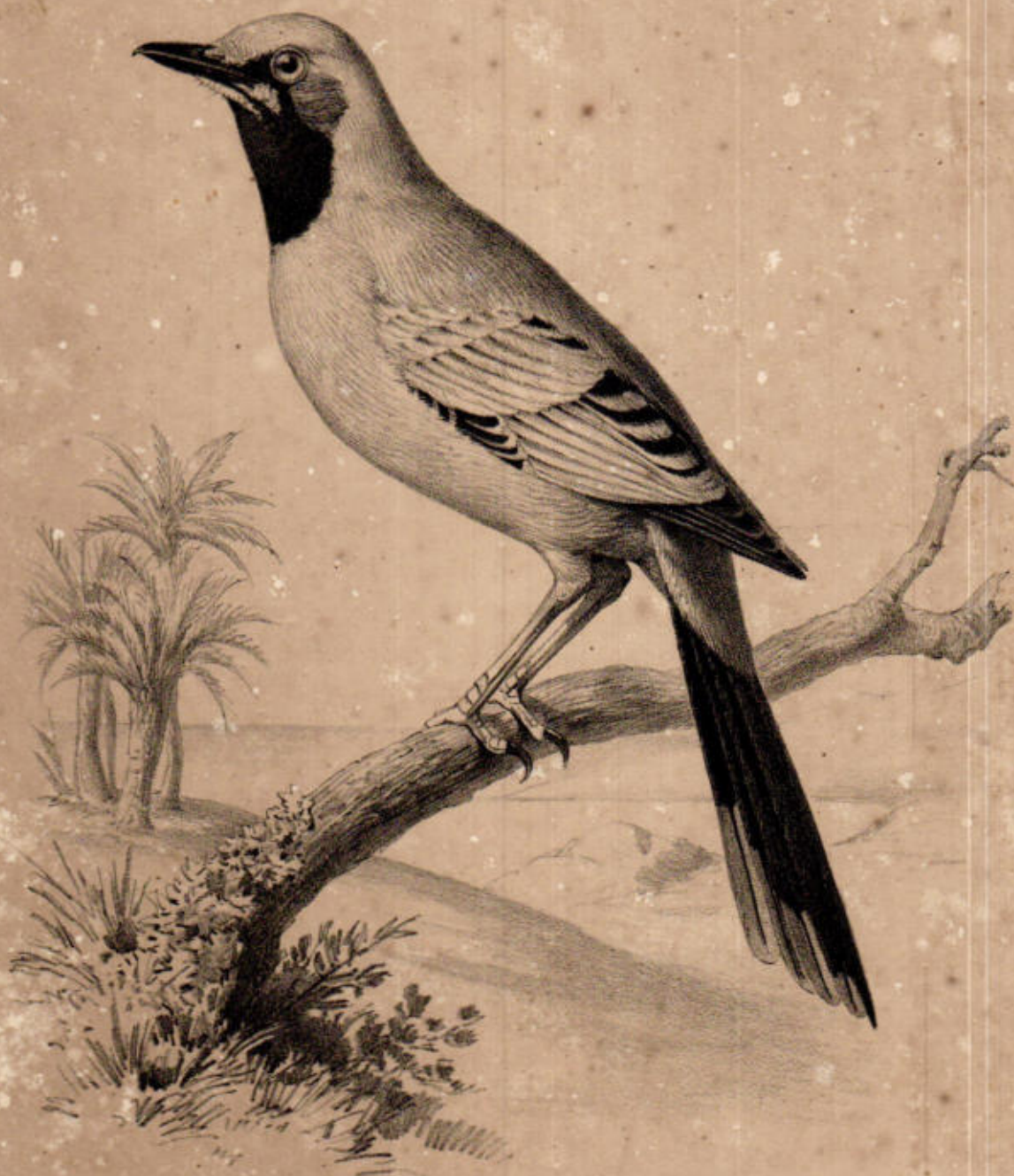
MIMOCICHLA PLUMBEA. Plumbeous Thrush