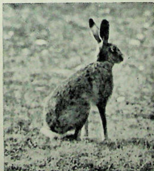
PHOTOGRAPHS OF COMMON HARES.