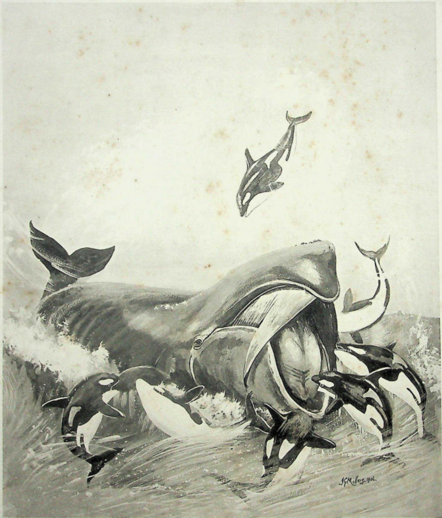
Killers attacking an Atlantic Right Whale