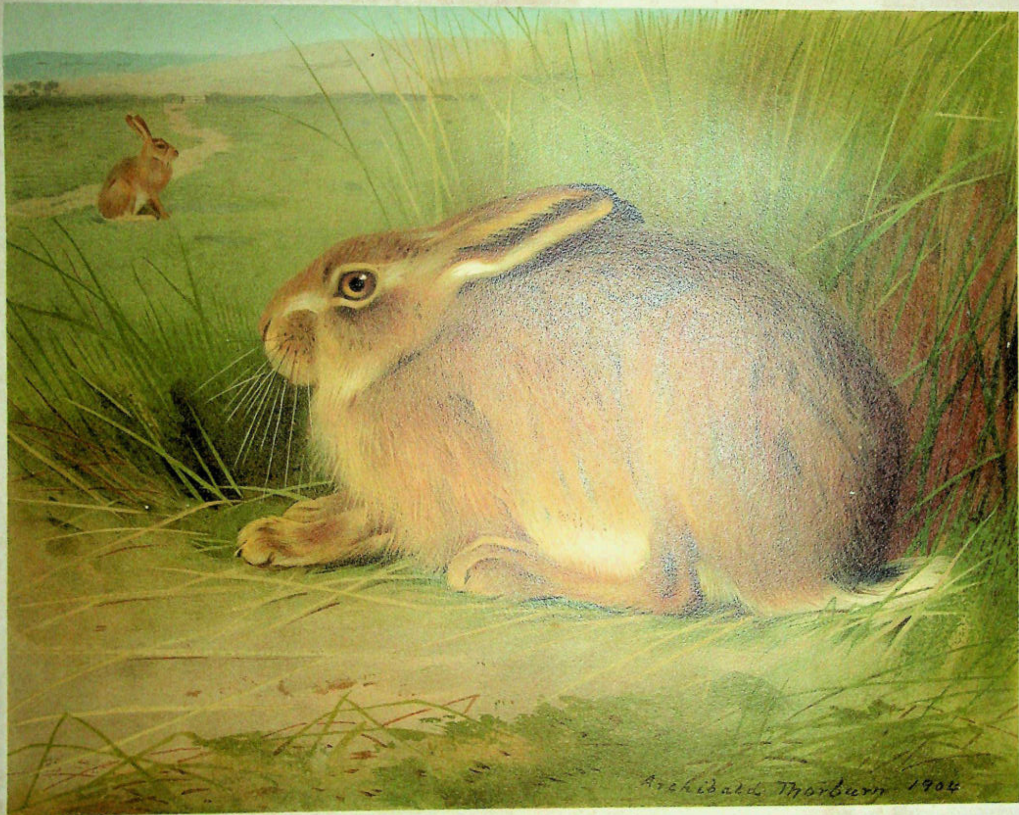
THE COMMON HARE. Lepus europæus.