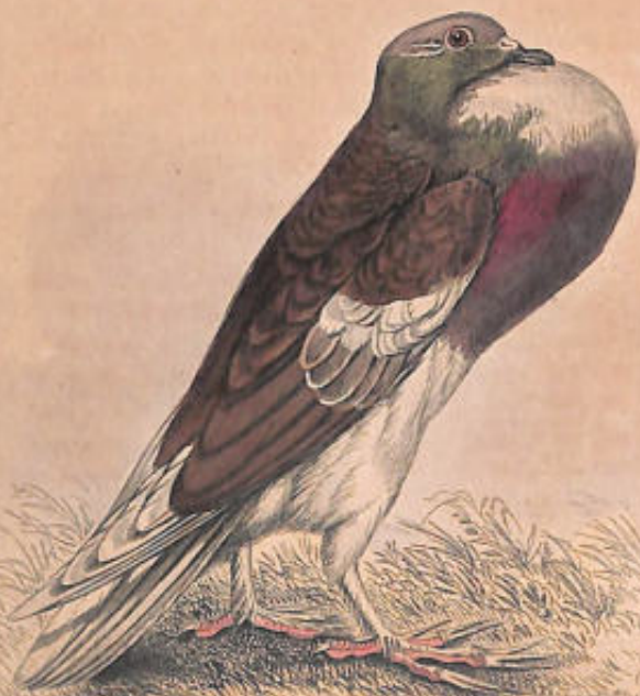
COLUMBA LIVIA VAR. GUTTUROSA