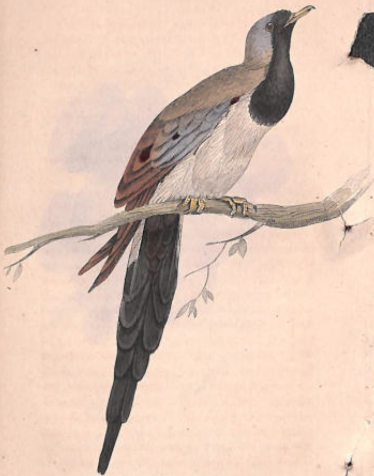
ECTOPISTES ? CAPENSIS.