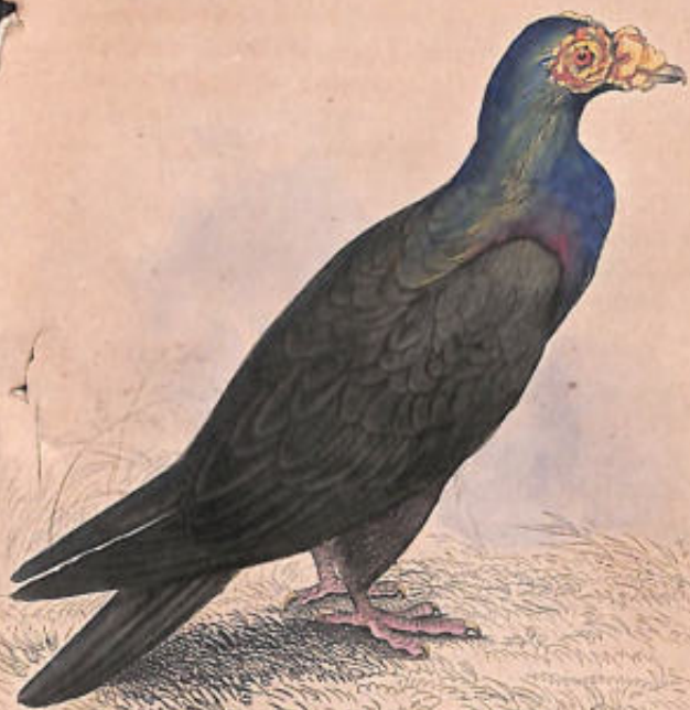
COLUMBA LIVIA, VAR TURCICA