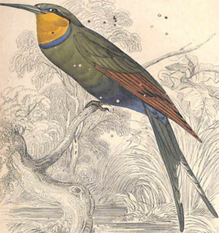
FORKED-TAILED BLUE-VENTED BEE-EATER.