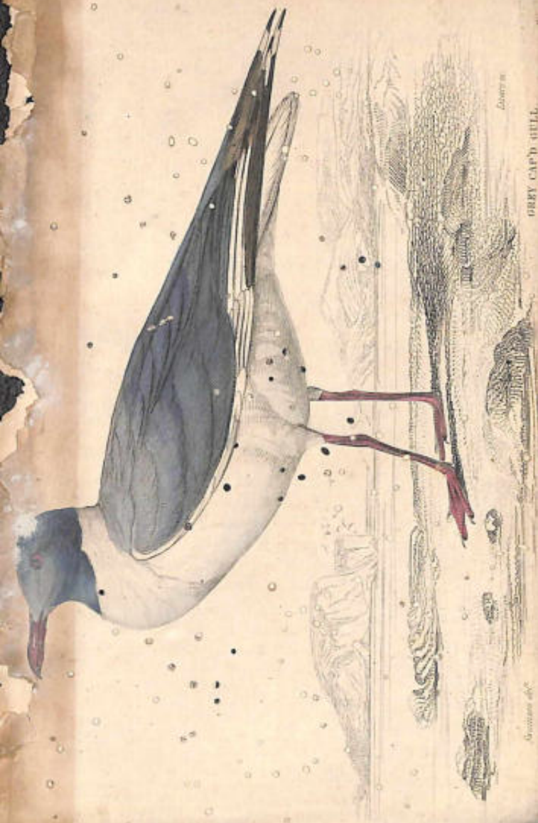
GREY CAP'D GULL.