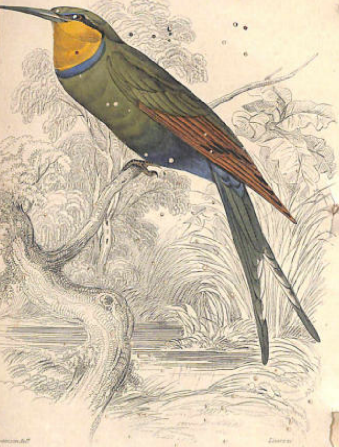
FORRELED-TAILED BLUE-FOOTED RED-LATER.