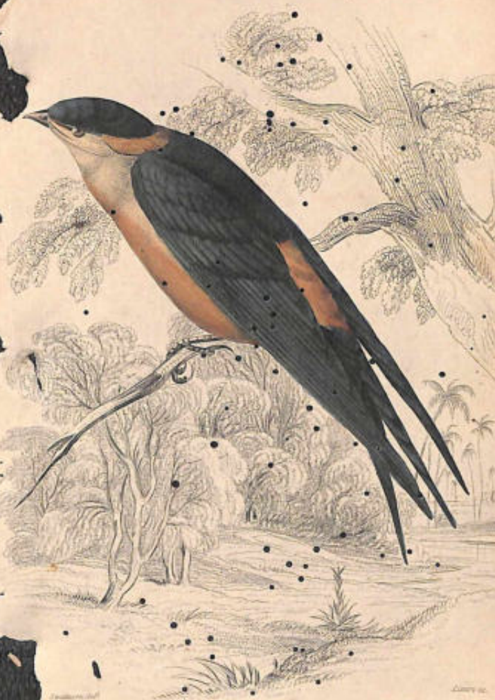
GREAT SENEGAL SWALLOW