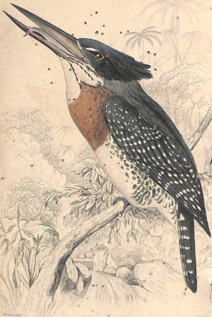
GREAT AFRICAN KINGFISHER.