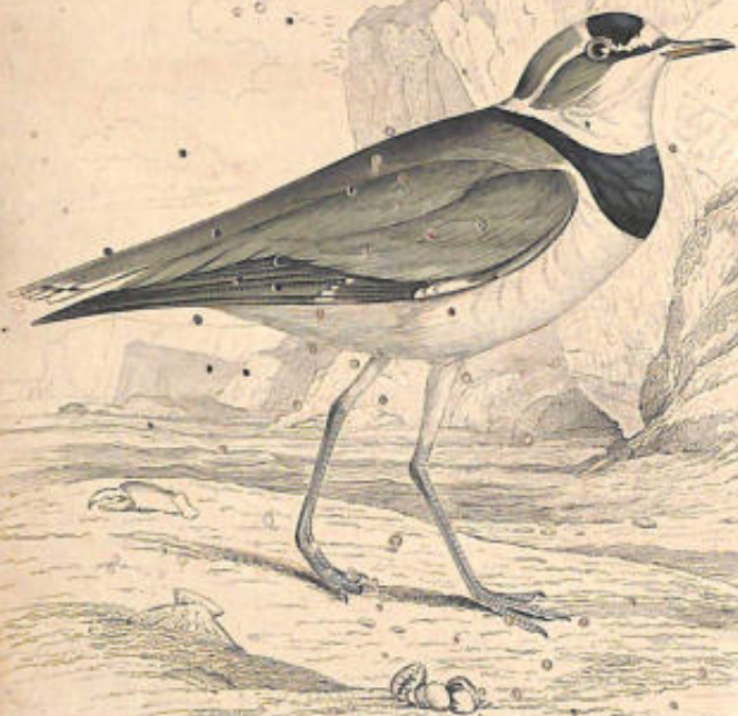
BLACK BONNETED PLOVER.