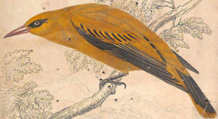
AFRICAN GOLDEN ORIOLE.