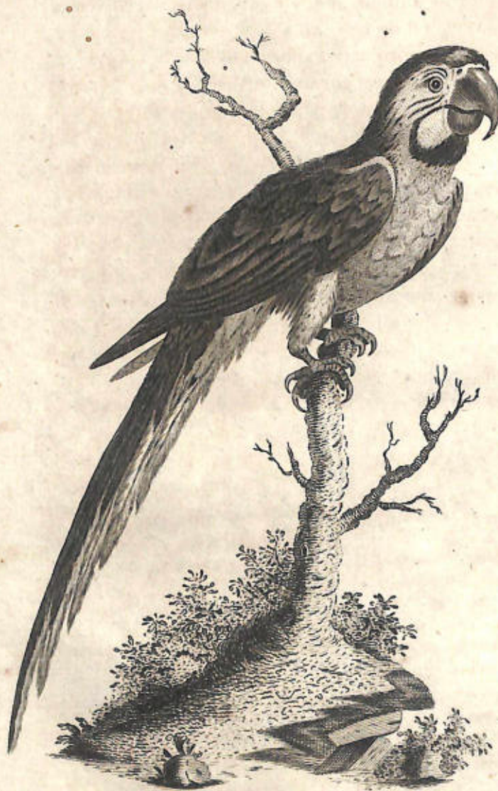
BLUE & YELLOW MACAW.