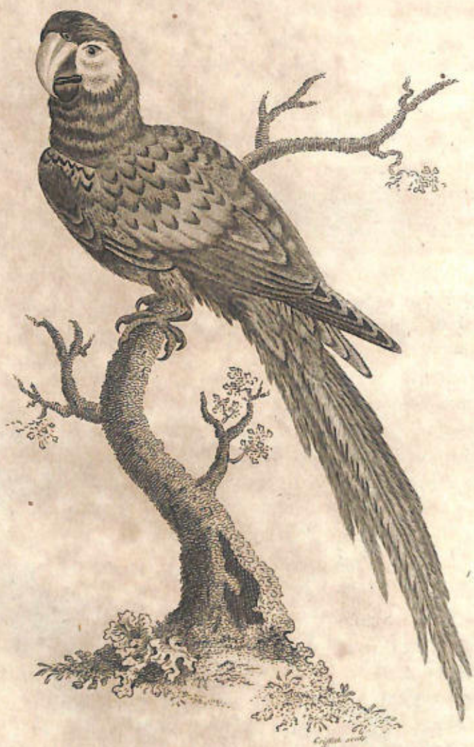
GREAT SCARLET MACAW