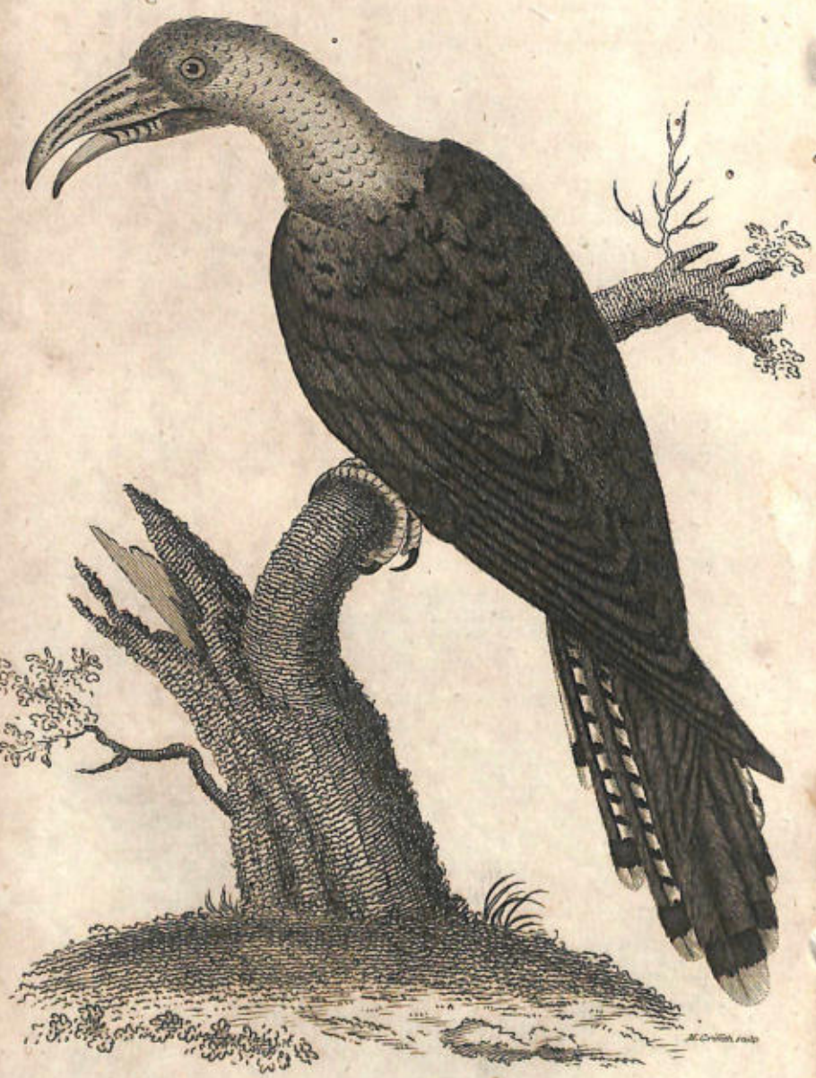
AUSTRALASIAN CHANNEL BILL.