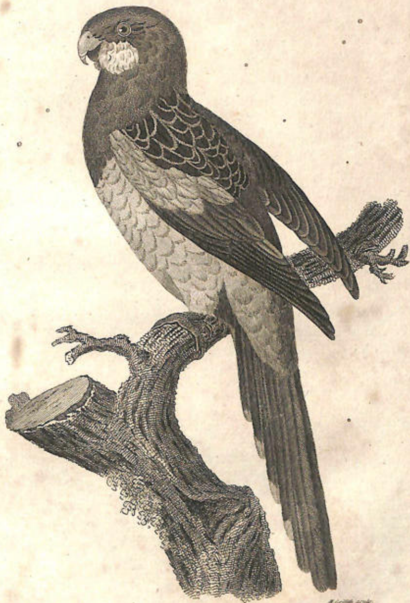
NONPAREIL PARRAKEET 1707.