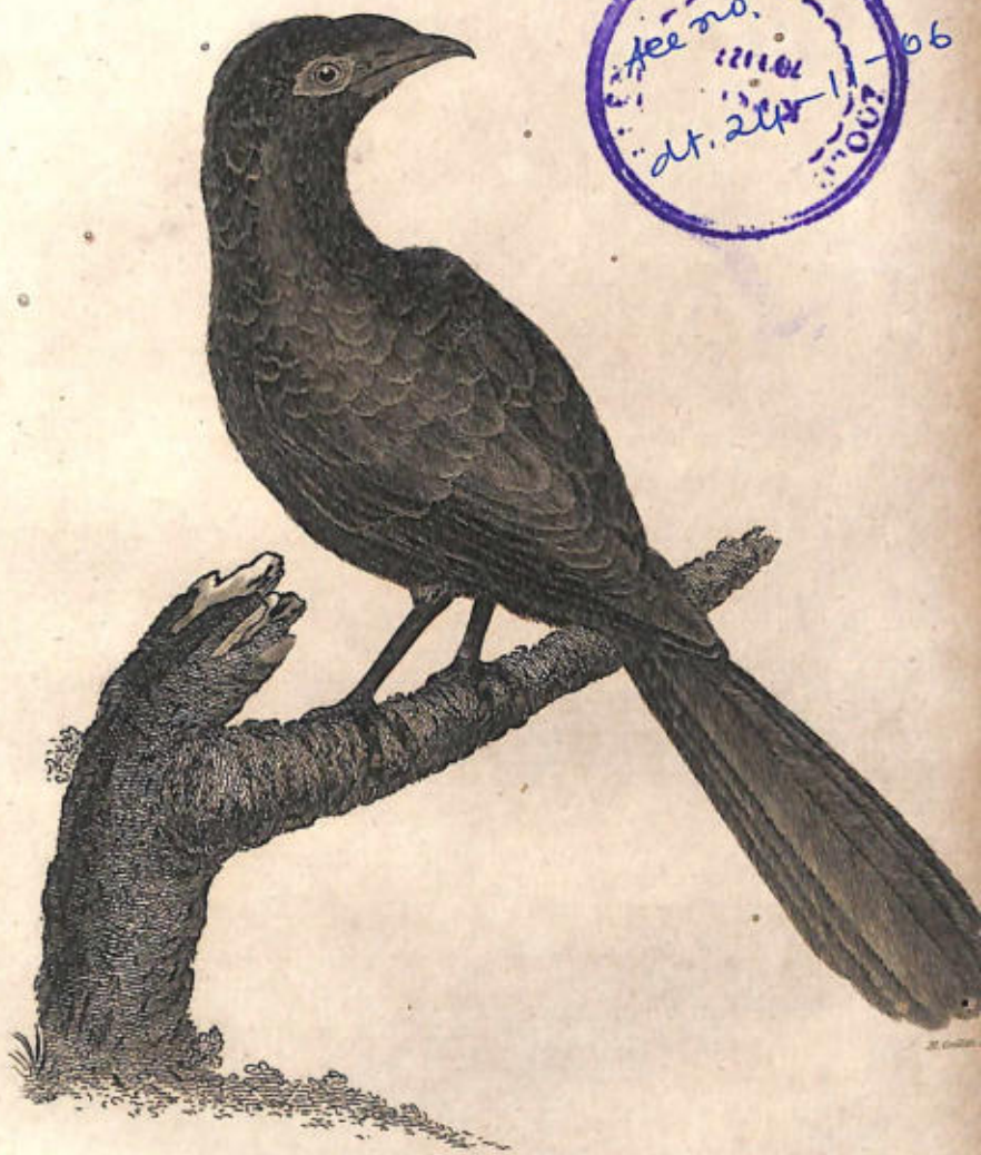
AMERICAN KEEL BILL.