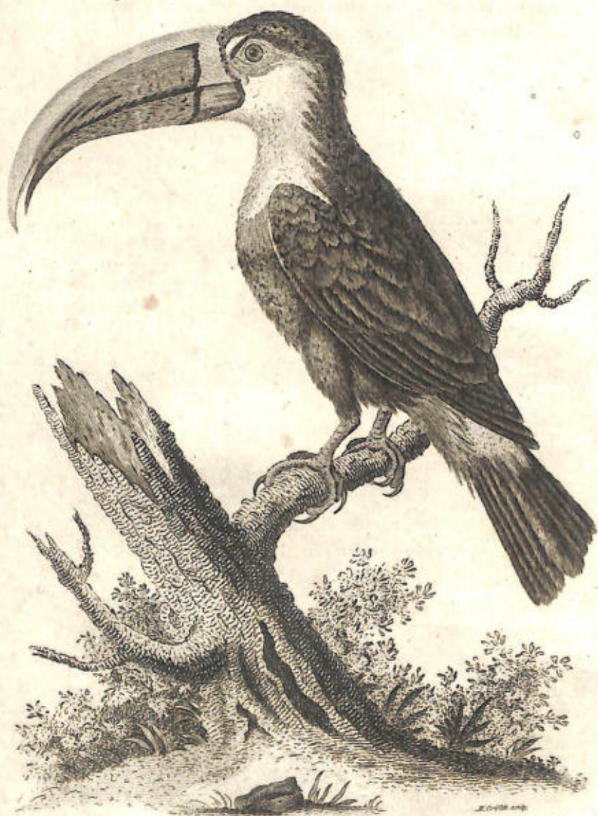
RED BILLED TOUCAN.