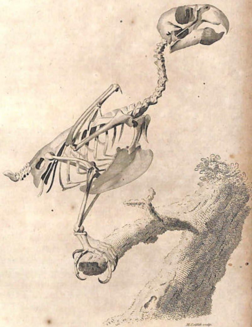
SKELETON OF ASH COLOURED PARROT.