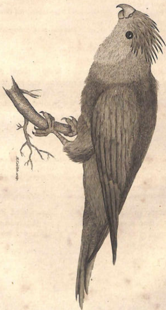
WHITE CRESTED PARAKEET.