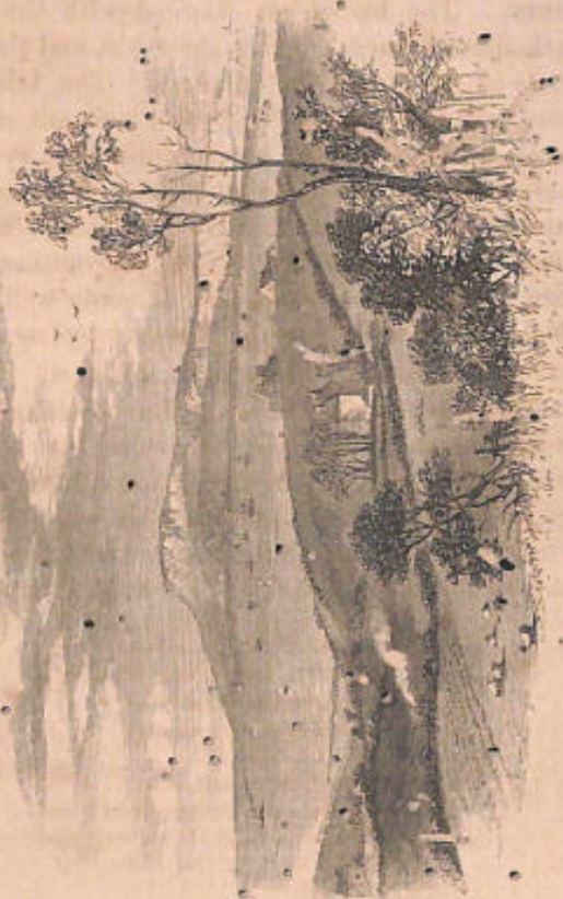
PORTLAND, FROM BELMONT.