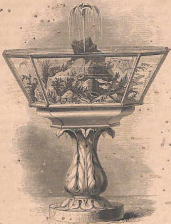
THE FOUNTAIN AQUARIUM.