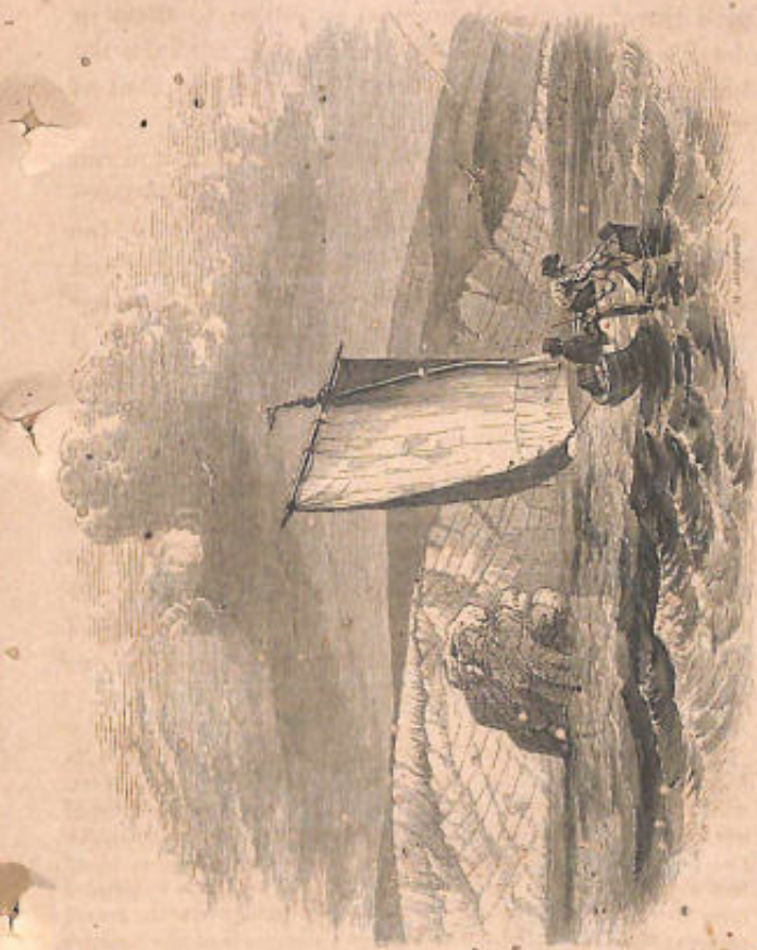
BREEDING, OFF WHITEHOUSE.