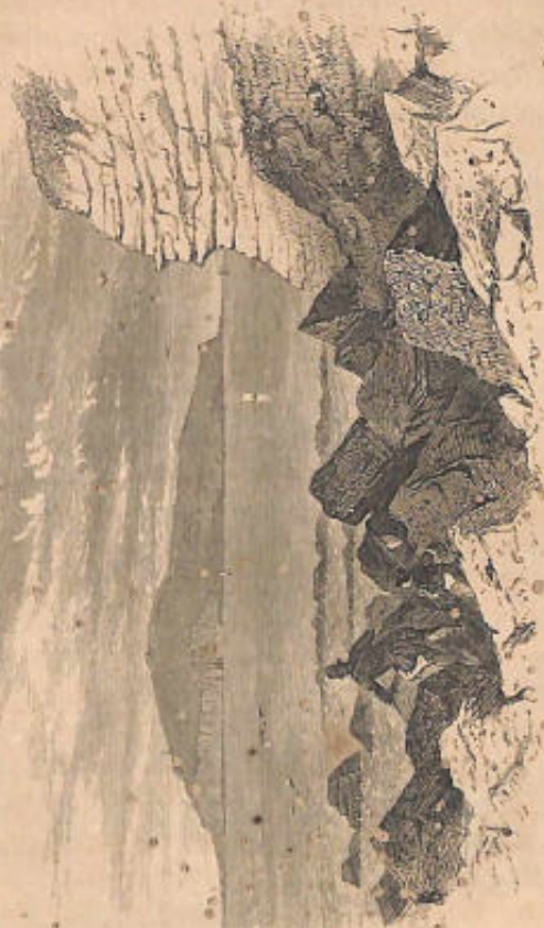
COLLECTING UNDER BYING CAJFF.